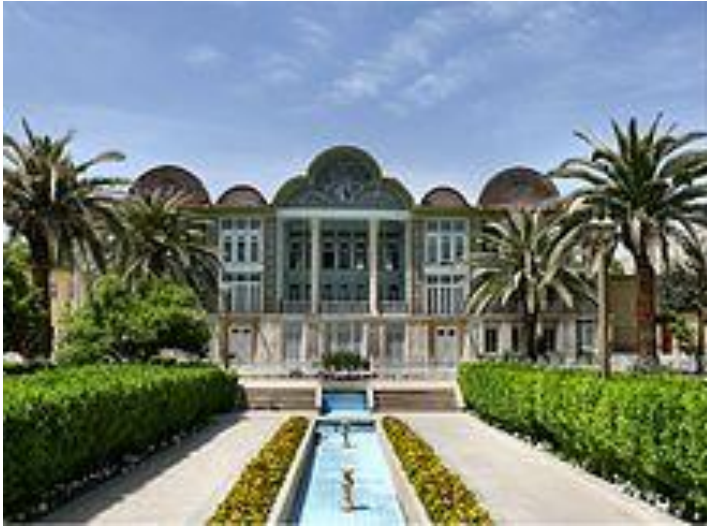
Baghe Eram – Shiraz / Iran